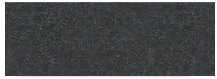
CARRARA DARK NIGHT